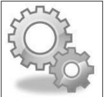
External Axis Control & I/O

Programming and connectivity is controlled through a simple USB interface to a laptop or desktop PC. Additional features such as external axis control, dedicated I/O, marking on the fly and camera assisted marking makes the Vereo™ a powerful tool for any production process.